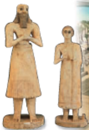
▲ Statues of Sumerians praying

How did people reach the upper levels of the ziggurat?