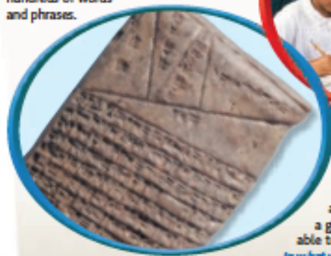
▲ Mesopotamian cuneiform tablet

THEN In ancient Mesopotamia, only boys from wealthy and high-ranking families went to the edubba , which means "tablet house." At the edubba —the world's first school—boys studied reading, writing, and mathematics and trained to be scribes. For hours every day, they copied the signs of the cuneiform script, trying to master hundreds of words and phrases.