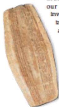
▲ Sumerian cuneiform

Sumerian Literature The Sumerians also produced works of literature. The world’s oldest known story comes from Sumer. It is called the Epic of Gilgamesh (GIHL•guh•mŏsh). An epic is a long poem that tells the story of a hero. The hero Gilgamesh is a king who travels around the world with a friend and performs great deeds. When his